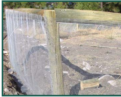
Wooden Top Rail

Hardware cloth (i.e. the galvanized mesh) can tear easily, so the upper edge requires strengthening by securing to a top rail or folding the mesh over taut smooth wire. This prevents tearing when people or animals go over the fence.