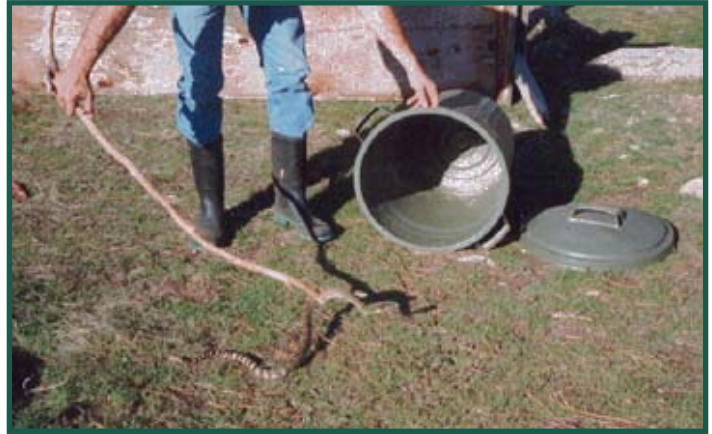
Directing a snake into a container

Rattlesnakes rarely need to be relocated in rural areas. Most often they can be avoided until they go on their way. In these cases, anyone who might come in contact with the snake should be notified and pets kept away. In situations where it is imperative to move a snake, if possible, only snake response personnel should carry out the task. This is to avoid accidental bites, as well as to protect the snake from injury by inexperienced handlers.