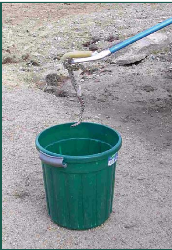
Using snake tongs

A variety of implements can be used to direct snakes into a container from which they cannot escape. Professional equipment such as snake hooks or tongs should be used to handle snakes. A long stick or other suitable implements may be effective snake handling devices when proper equipment is not available. If the tongs have an interlocking tooth, be wary of the tooth's position relative to the snake's body so the tooth does not pin the snake causing bodily injury. Regardless of what tool you use, be careful as a snake's organs can be easily damaged.