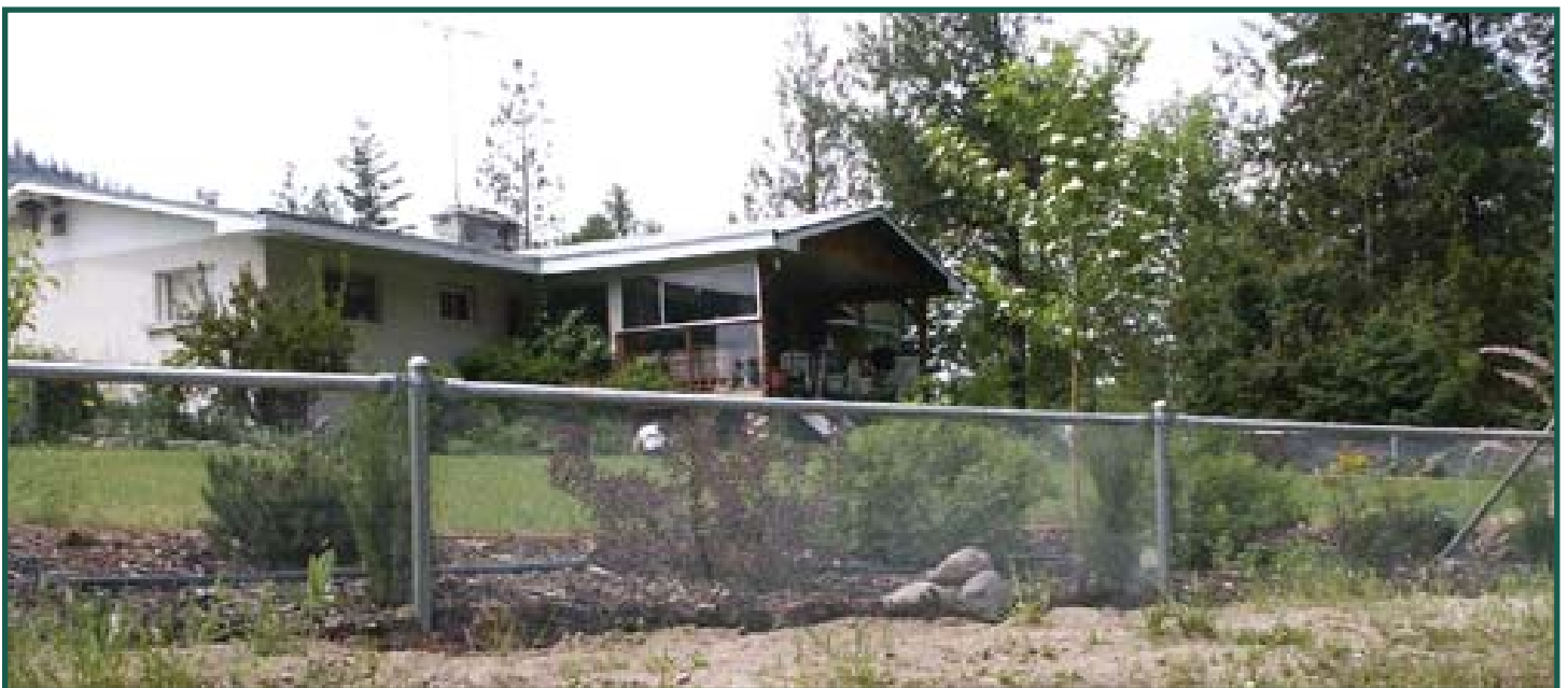
A home with snake exclusion fencing

The Provincial Wildlife Act and the Federal Species at Risk Act prohibit the harassment, killing, or capturing of listed snakes.