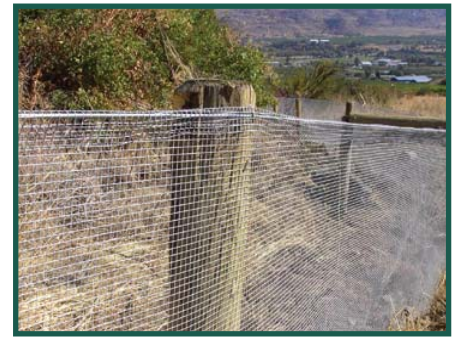
Smooth Wire Edge