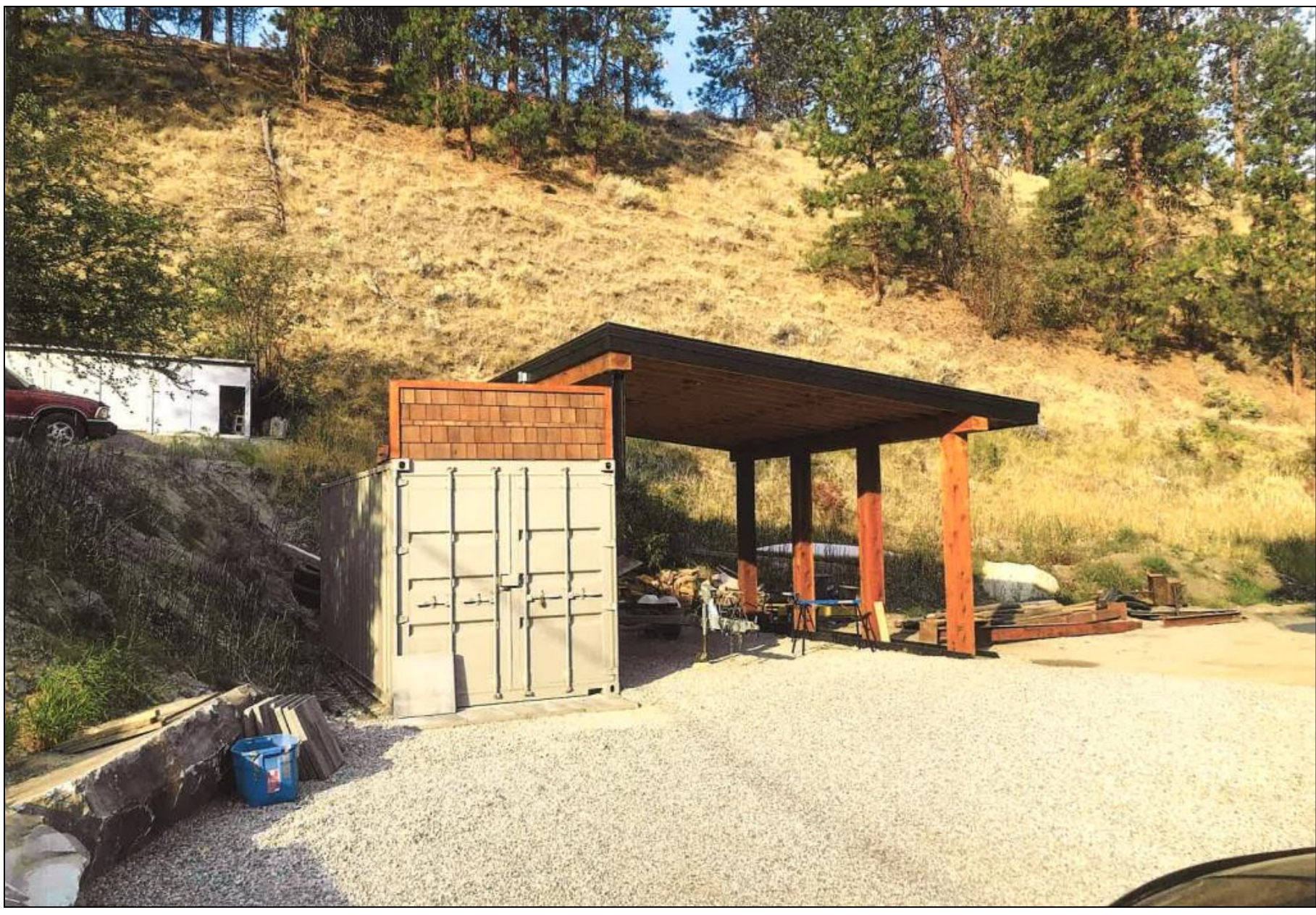
Attachment No. 1 – Site Photo