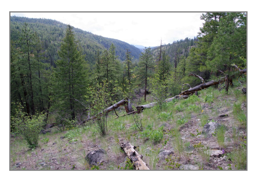
Photo 1 – Mixed aged stands of ponderosa pine and Douglas fir occur on the subject property.

Open Douglas fir – ponderosa pine forests are commonly on moderate to steep warm aspects with deep, medium-textured colluvial or morainal soils.