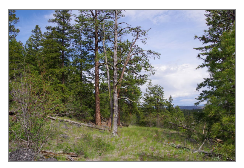
Photo 4 – The subject property supports an abundance of wildlife trees.

Suitable foraging and nesting habitat for Lewis's Woodpecker were noted on the property and on adjacent provincial public land to the west. Approximately 40 wildlife trees (ponderosa pine and Douglas fir) were recorded on the subject property (see Photos 2 and 4) in addition to fruitbearing shrubs and perennial grasses in the understory layer. No Lewis's Woodpeckers were observed during the assessment.