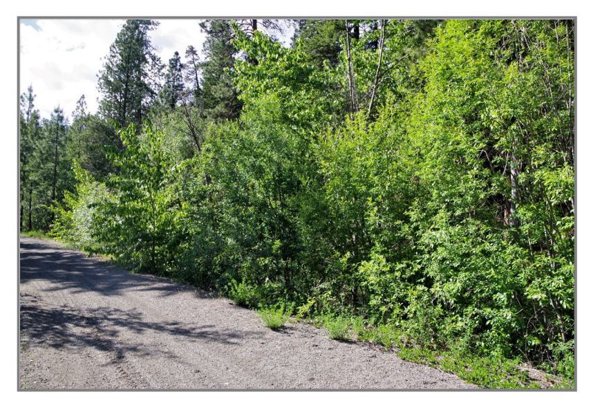
Photo 3 – A small area of riparian habitat was recorded along the KVR trail.

A patch of riparian vegetation supporting willow, black cottonwood, Douglas maple and water birch was observed along the southern boundary bordering the old railway bed (Photo 3). The RDOS has noted this as being within a Watercourse Development Permit Area. Historically, the area likely supported a natural meander of Trout Creek; however, the construction of the railway in the early 1900s has since provided a barrier to water flow on the subject property.