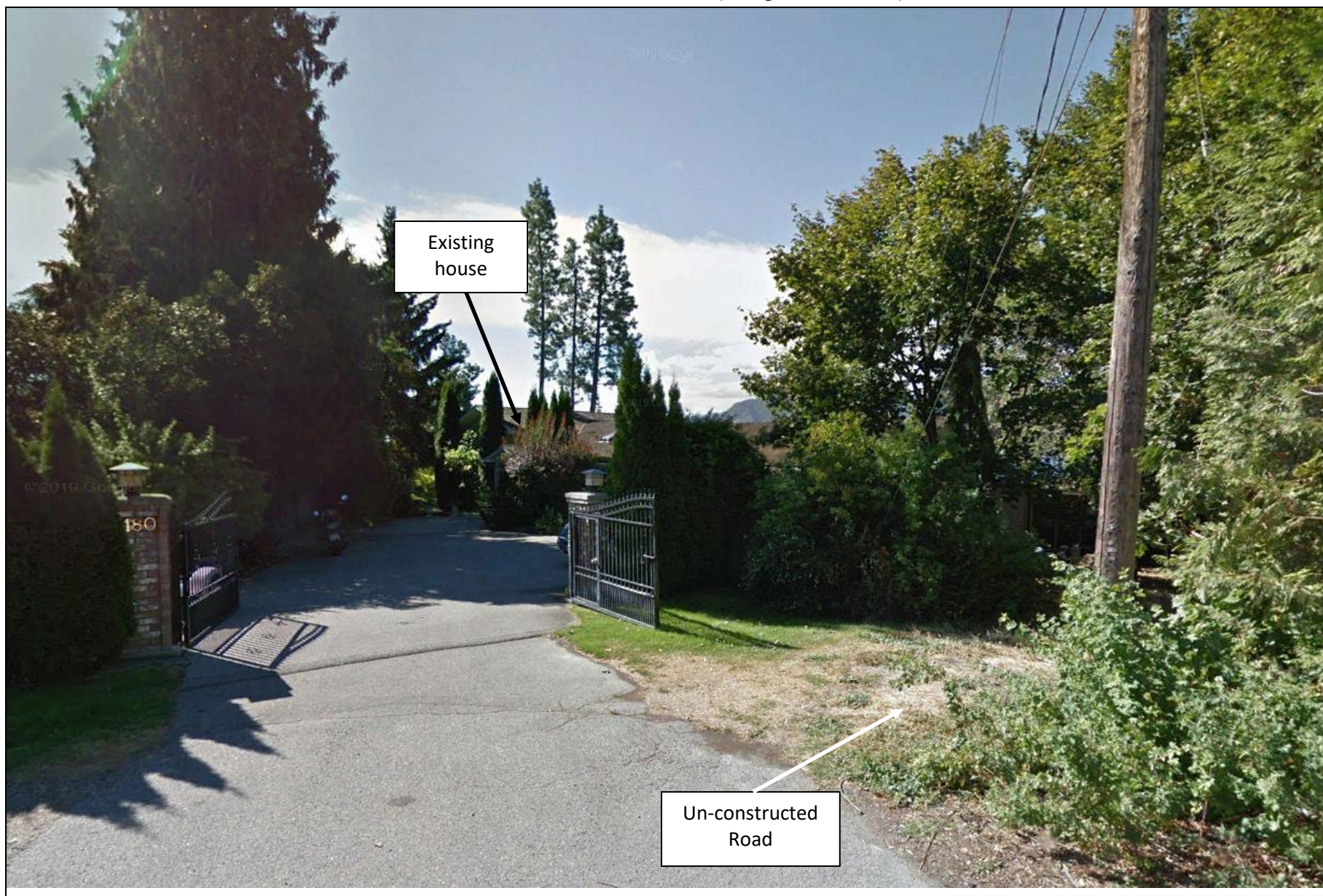
Attachment No. 3 – Site Photo