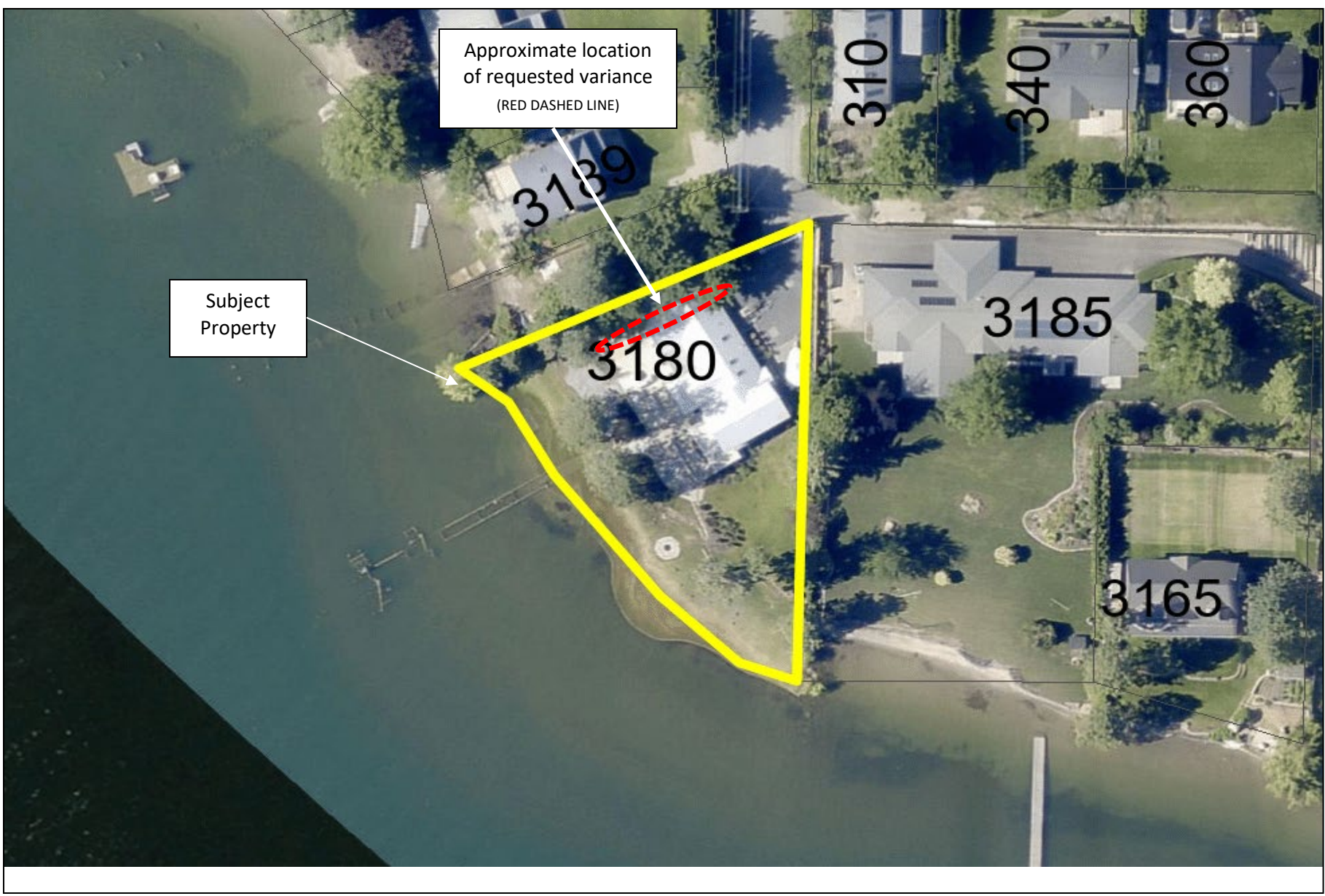
Attachment No. 1 – Aerial Photo