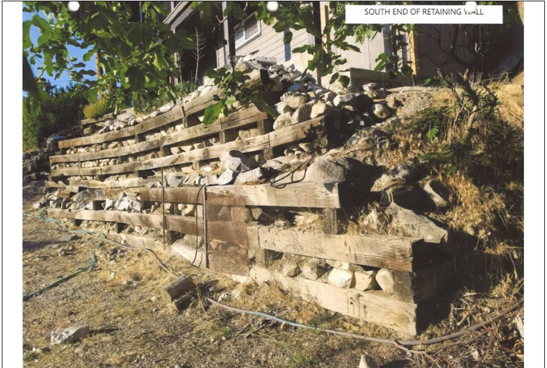
Attachment No. 3 – Site Photo (Existing Retaining Wall from South)