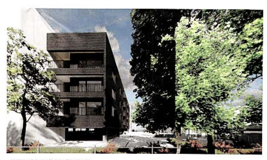
VIEW LOOKING SOUTH EAST