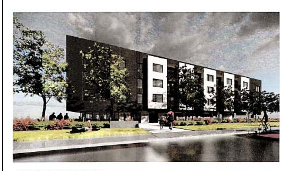
VIEW LOOKING NORTH EAST