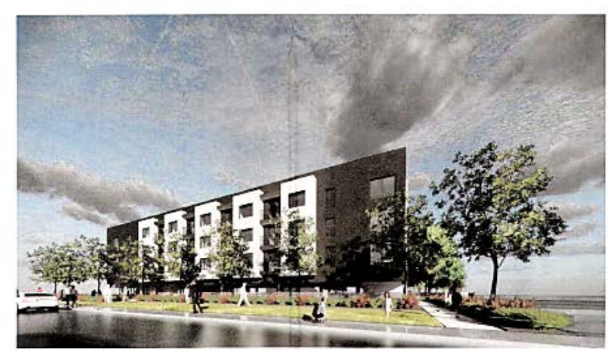
VIEW LOOKING NORTH WEST