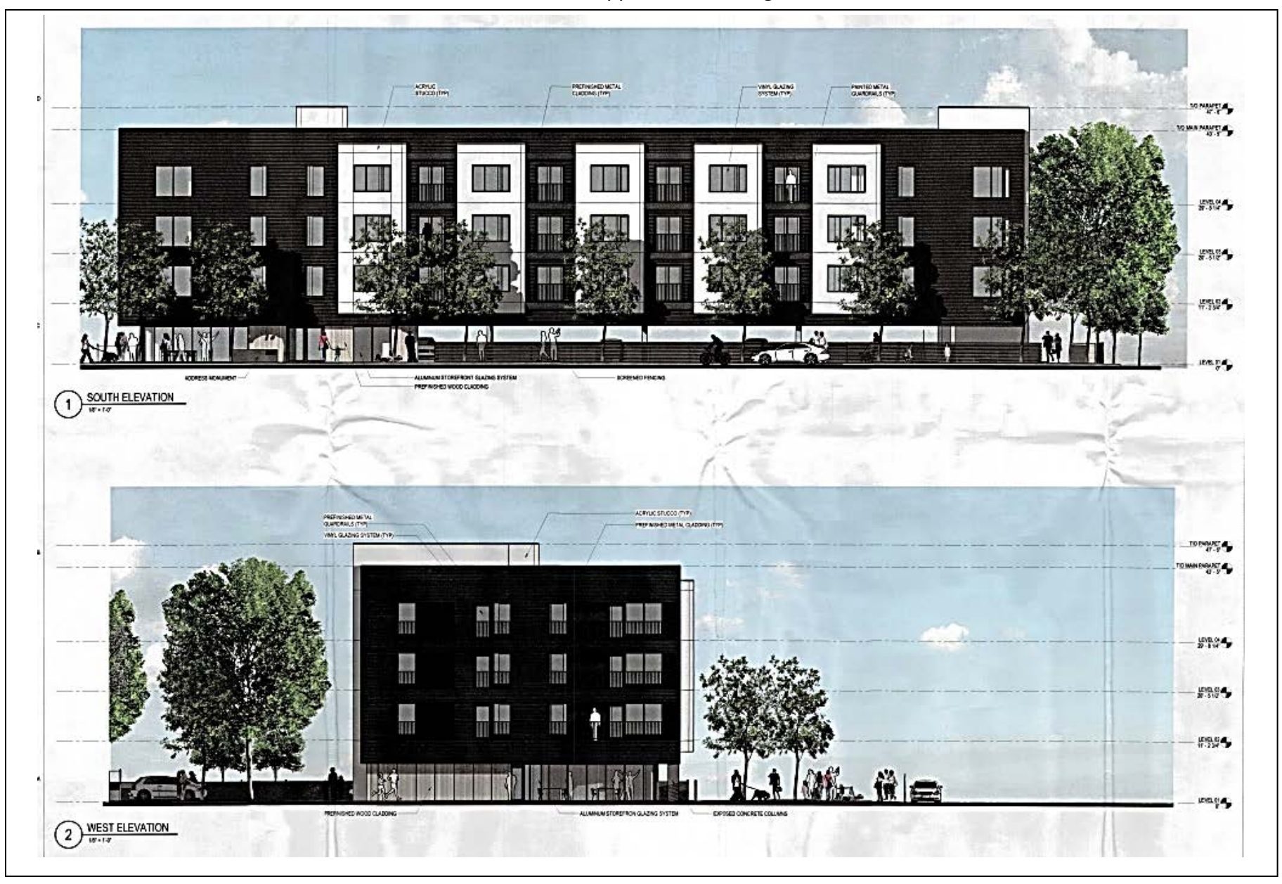
Attachment No. 4 – Applicant's Building Elevations