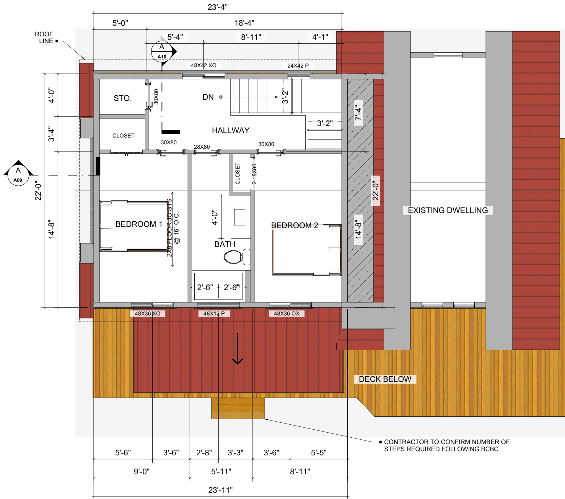
A UPPER FLOOR PLAN 04 Scale: 3/16" = 1'-0"