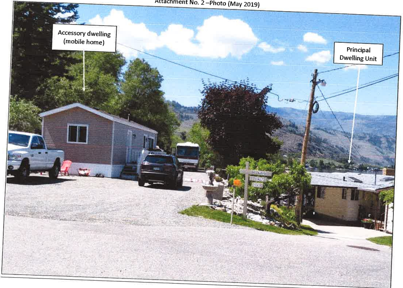
Attachment No. 2 –Photo (May 2019)