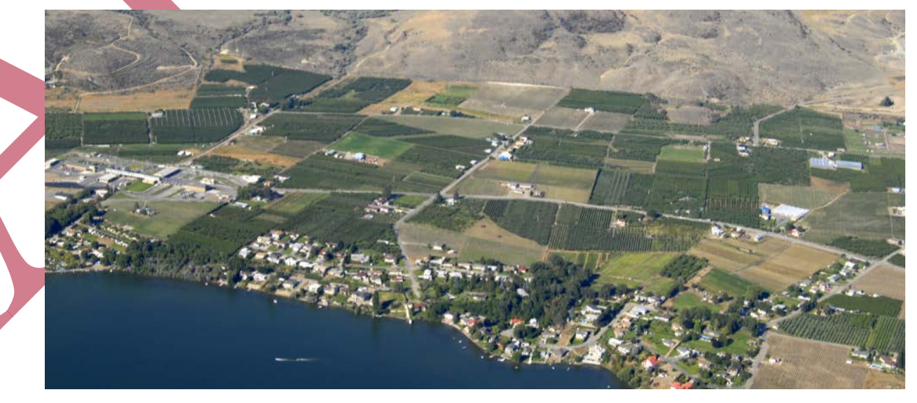
Figure 2: Osoyoos Lake South (west side)

The Town of Osoyoos operates a community water system in the west side of this area after assuming the functions of the former South Okanagan Lands Irrigation District (SOLID) in 1990, while the Osoyoos Irrigation District (OID) operates a similar system on the east side of the lake, and the Boundary Line Irrigation District operates a system south of the Town of Osoyoos. There is no community sewer system in this area, with the exception of a dedicated line that extends from the Town to service the buildings at the Canada Border Services Agency Osoyoos-Oroville Border Crossing.