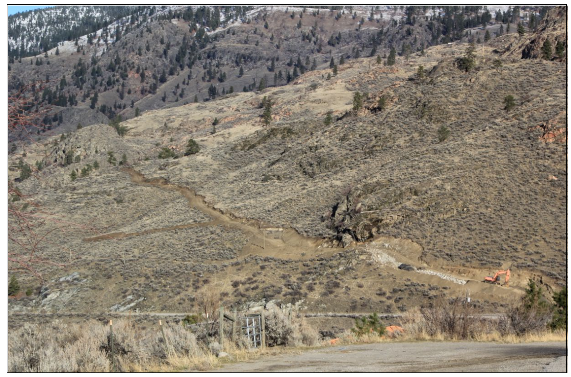
Attachment No. 2 – Site Photo