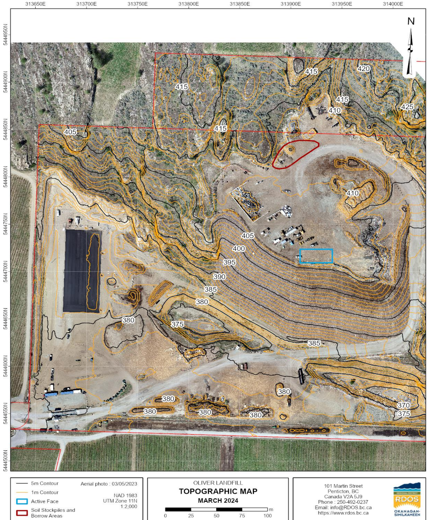
Figure 1(b): March 2023 Oliver Landfill Topographical Map