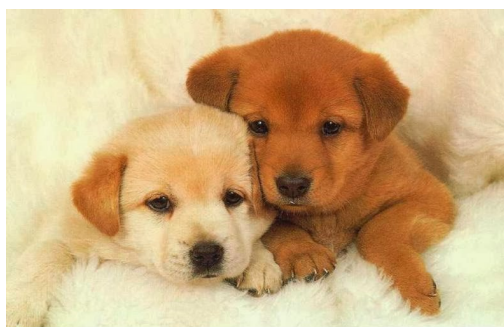
DOG CONTROL BYLAW 2671, 2017

You may view a copy of the RDOS Dog Control Bylaw No. 2671, 2017 at www.rdos.bc.ca by visiting the REGIONAL BYLAWS page and clicking on Bylaw Enforcement.