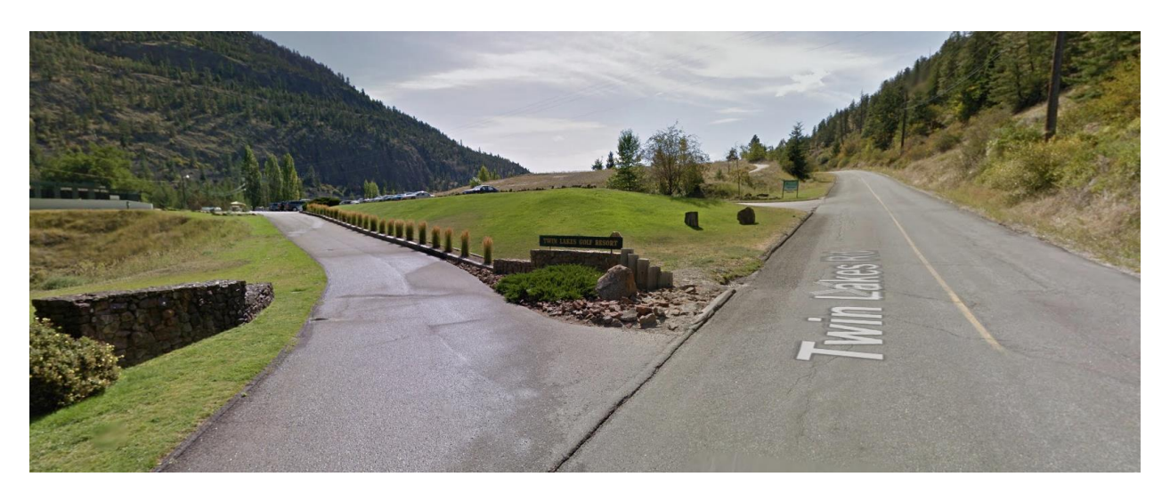
Illustration 2: Accesses as seen from Twin Lakes Road