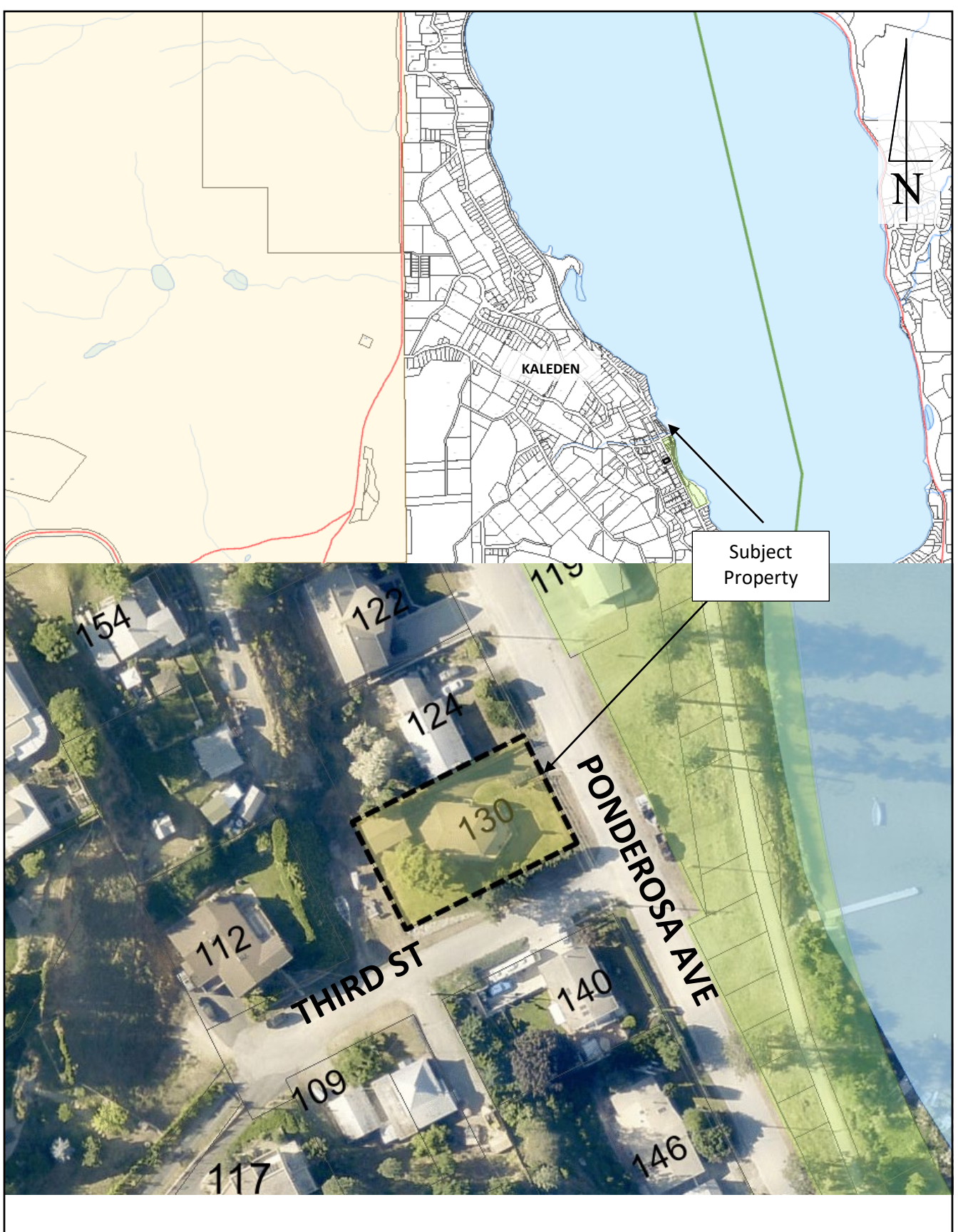
Attachment No. 1 – Context Maps