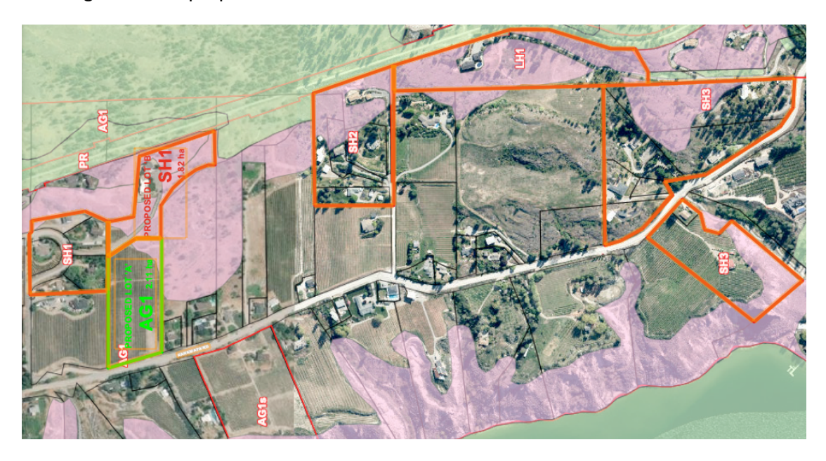
Naramata Road Neighbourhood Plan Showing AG1 Land & Adjacent SH1 & LH1 Parcels

The proposed AG1 Lot A will maintain the existing 2 ha vineyard planting in a more viable & affordable farm parcel. The proposed AG1 2.11 ha Lot A will be more affordable in value and protect the same level of agricultural production as it was prior to 2007. The Naramata Rd Access will also allow for commercial frontage in the future, consistent with neighbouring property uses & consistent with ALR objectives. The proposed AG1 2.11 ha Lot A "subdivision will allow for more efficient use of agricultural land & the better utilization of future farm buildings for farm purposes".