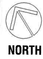
1 Site Plan A.0 Scale 1/8" = 1'-0" (showing lower level)

PROPOSED ELEVATION 1000.00 EXISTING ELEVATION 000.00 Existing grade contours taken from Mandeville Land Surveying topographic survey dated Nov 20, 2018