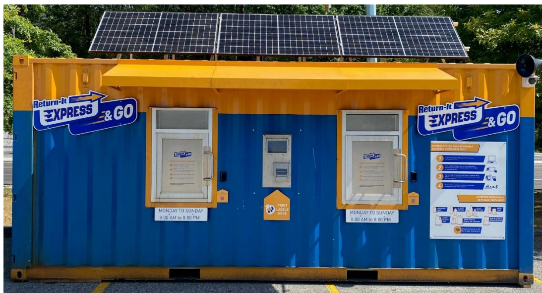
Figure 2: An example of one of the currently operational Express & Go locations

The Express system is also a great way for charitable, sport or student organizations to fundraise. Charities and non-profit organizations can set up an Express account and provide their account information to their supporters who may want to direct the funds from their containers to a cause of their choice.