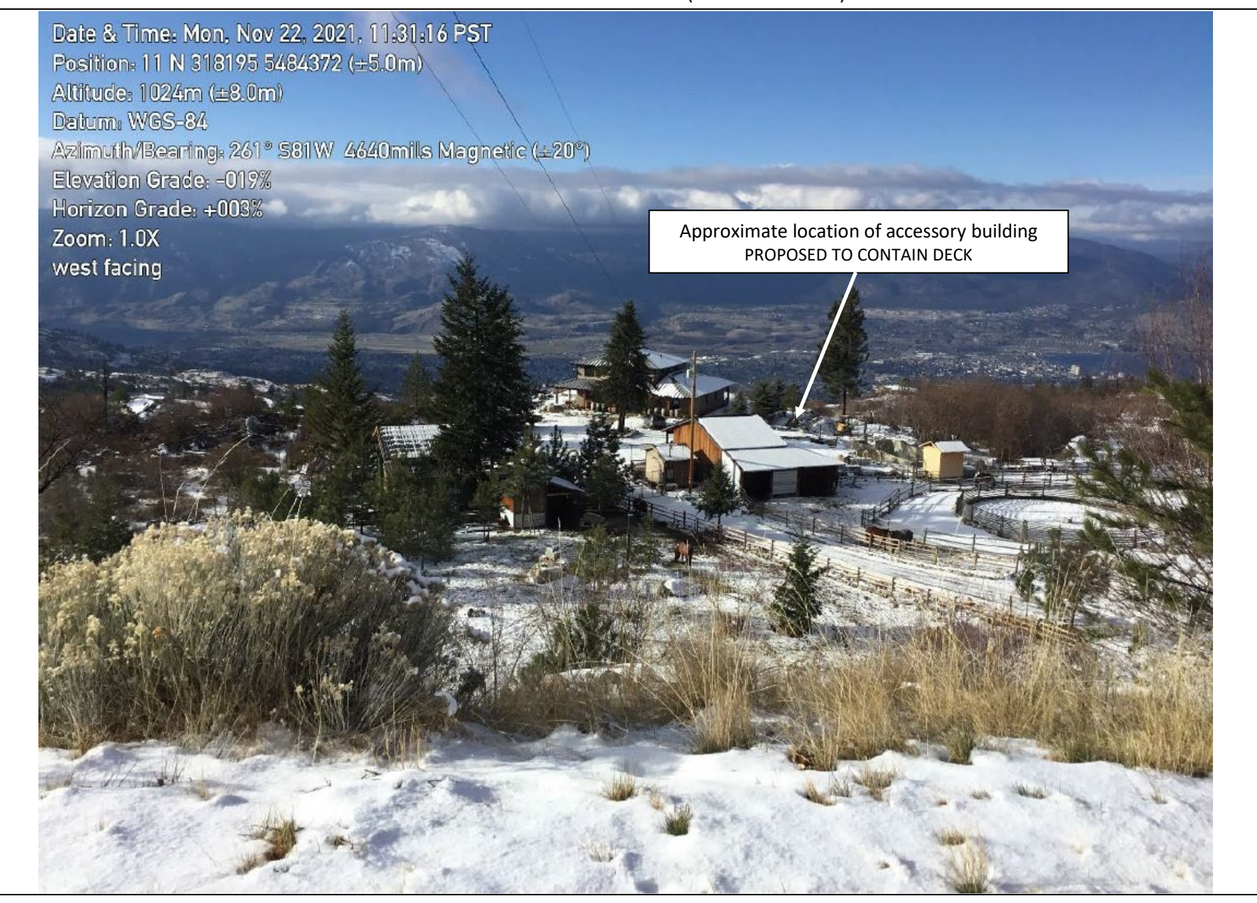
Attachment No. 2 – Site Photo (November 2021)