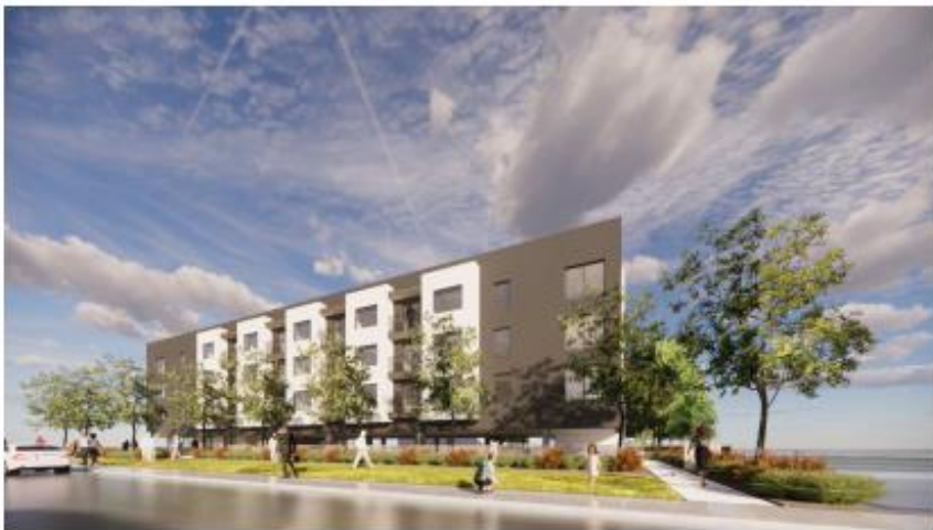
VIEW LOOKING NORTH WEST