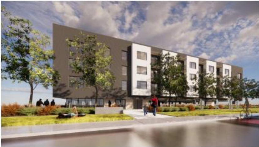
VIEW LOOKING NORTH EAST