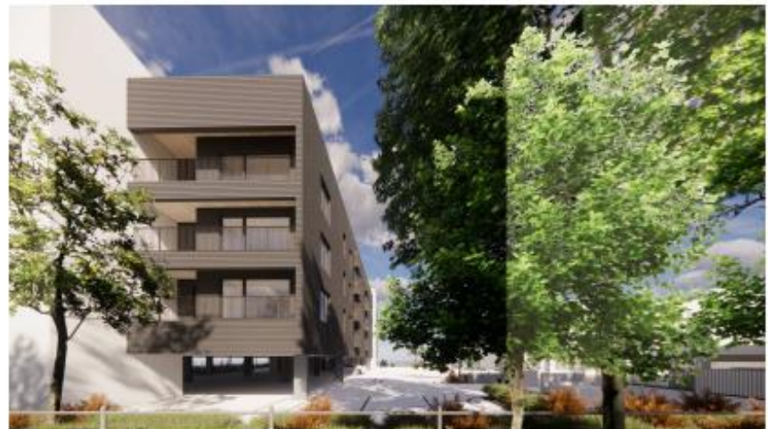
VIEW LOOKING SOUTH EAST