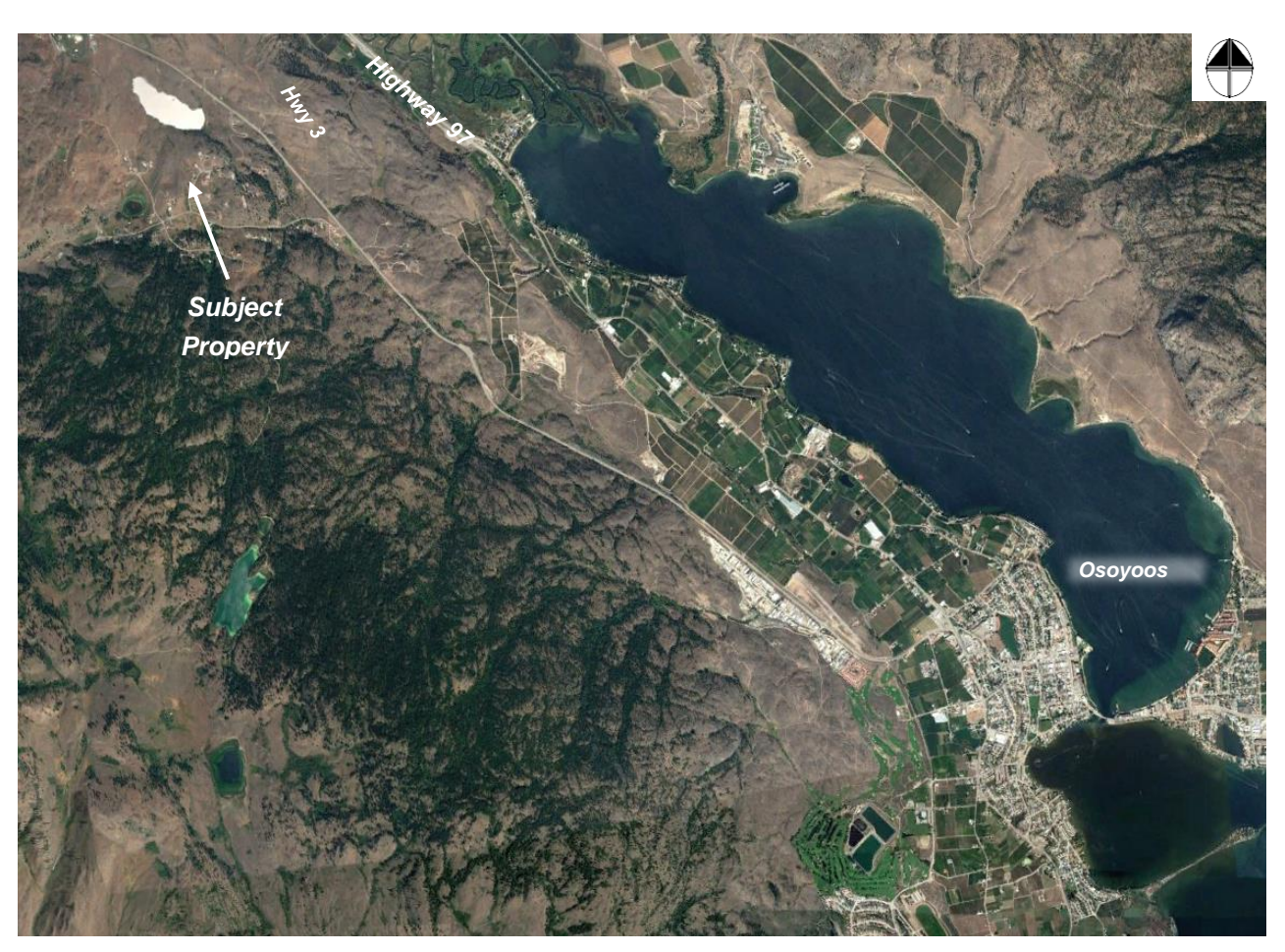
Illustration 1: Location

The subject property is located on Old Richter Pass Road in the Kilpoola neighborhood approximately 1.2 km west of Highway 3 and 6 km northwest from Osoyoos. The property is within Electoral Area 'A' of the Regional District of Okanagan-Similkameen and its location is noted below in Illustration 1.