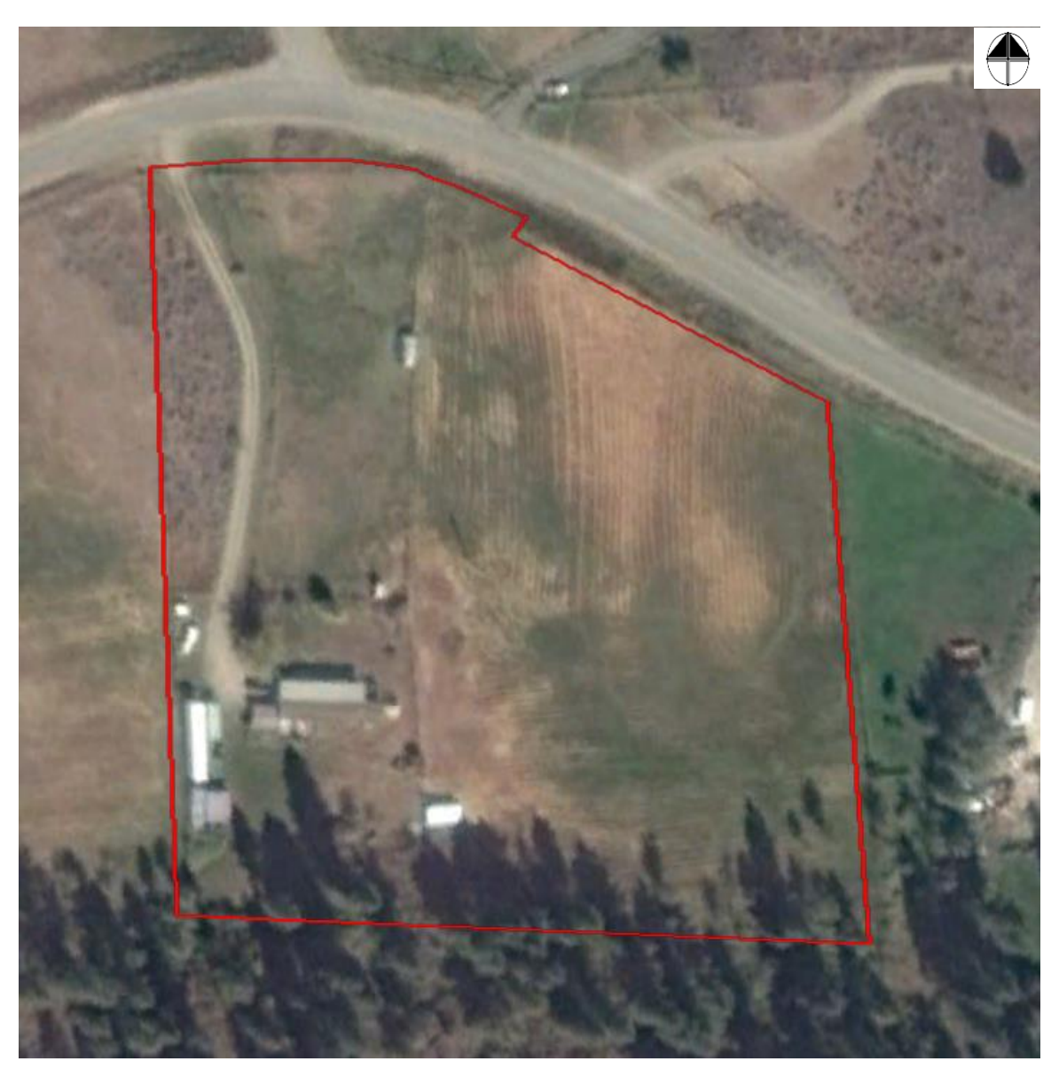
Illustration 2: Site Features - Ortho Image

The subject property is accessed from Old Richter Pass Road and is 2.02 hectare in size. The easterly and northwest portions of the land have been used for hobby agriculture. Between the driveway to the house on the property and the west fence line exists a natural area that includes sagebrush and other native grasses. The property contains a dwelling, covered storage building, and small structures for hobby agriculture. The south edge of the property sits at the toe of a treed slope. To the west and east of the property are adjacent small holdings properties with single family residences. Site features of the property are noted on Illustrations 2 and 3.