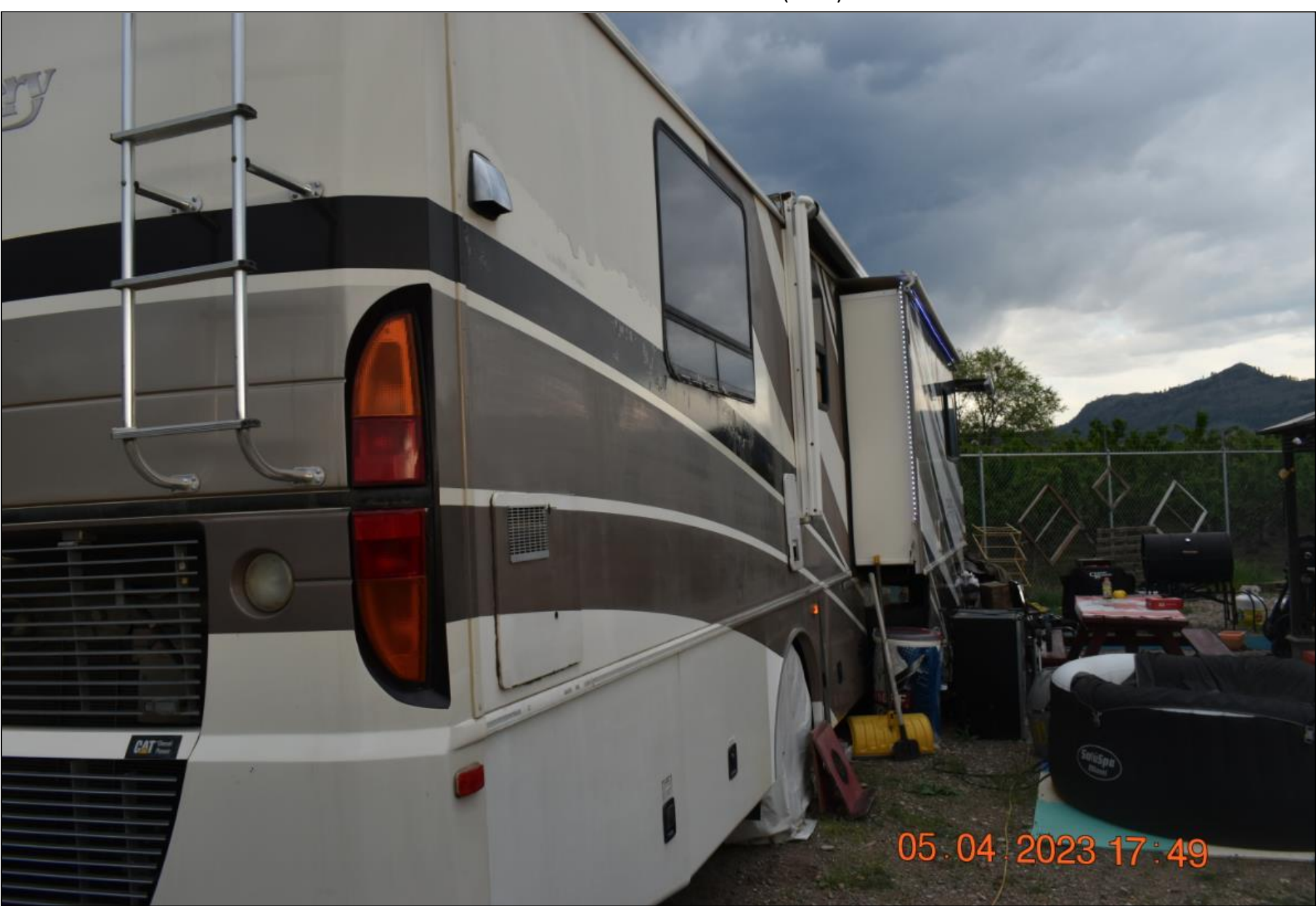
Attachment No. 7 – Site Photo 4 (2023)