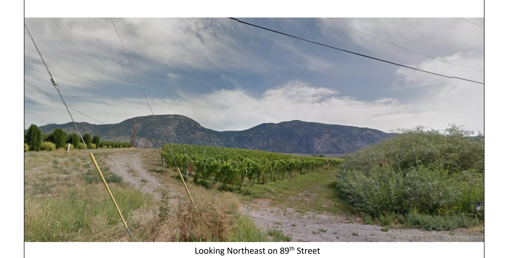
File No: A2021.020-ZONE