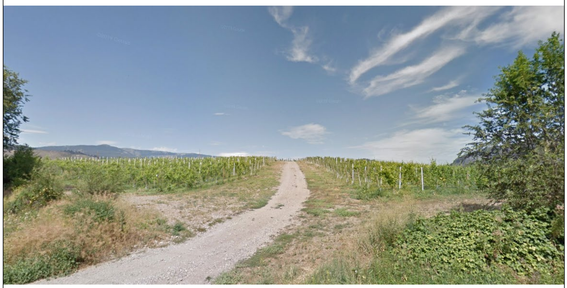
Looking Northwest on 148<sup>th</sup> Avenue