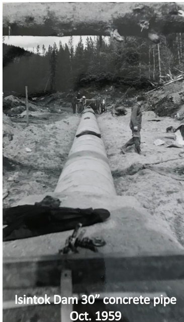
Isintok Dam 30" concrete pipe Oct. 1959

The water in the Isintok Reservoir will be lowered through June and July to allow for fish salvage and construction to commence in late July. To ensure that there is adequate water available for Summerland through the remainder of the growing season, Thirsk and the upper reservoirs will be kept full for use while construction is underway. Access to the Isintok Reservoir will be closed during this time and the District will provide regular updates to the public.